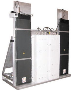
Detector side of skid