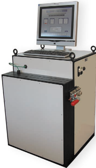
BM-185E Gamma 1 ft 3 box monitor